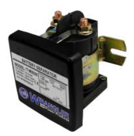
Battery Separator Part No. 17-MBS200

The Wrangler NW Power Products Battery Separator is designed for use in multi-battery applications as a solenoid priority system to protect the chassis charging system from excessively loading while allowing auxiliary batteries to be charged. The battery separator has two basic operational characteristics: